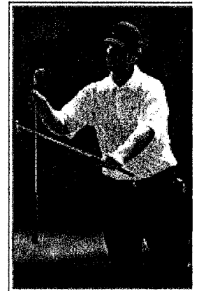
David Duval, struggling to get a grip on his game, grat a club from his caddy at No. 14 Thursday.

It was a normal day of golf for John Daly. Stuffed inside his bag were a cartoon of Marlboros and six-pack of Diet Coke. Oh, and let's not forget his putter called the Dunlop Redneck. No, really, he does.